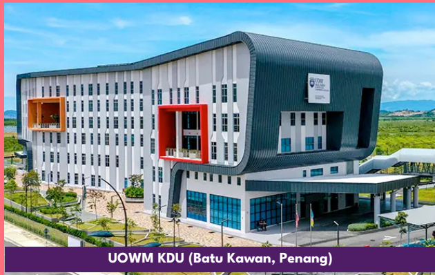
UOWM KDU (Batu Kawan, Penang)