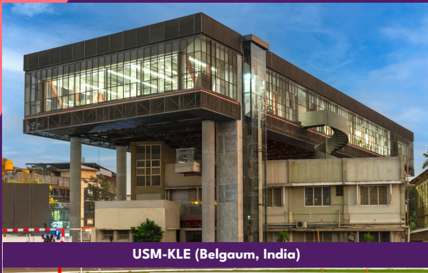
USM-KLE (Belgaum, India)