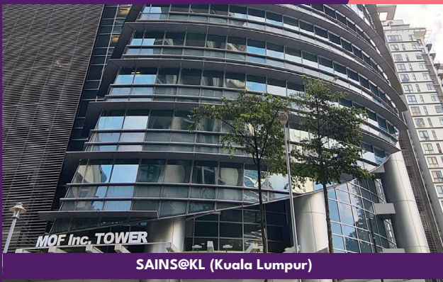
SAINS@KL (Kuala Lumpur)