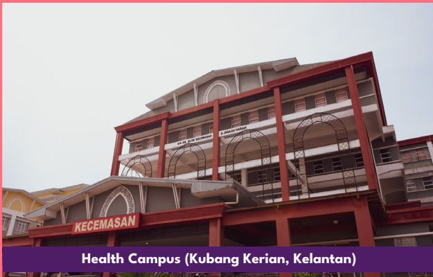
Health Campus (Kubang Kerian, Kelantan)