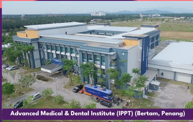
Advanced Medical & Dental Institute (IPPT) (Bertam, Penang)