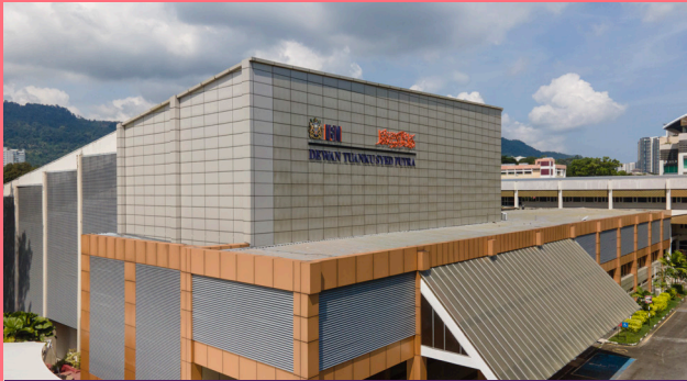
Main Campus (Penang Island)