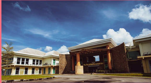
Engineering Campus (Nibong Tebal, Penang)