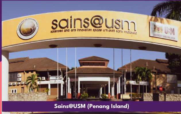
Sains@USM (Penang Island)