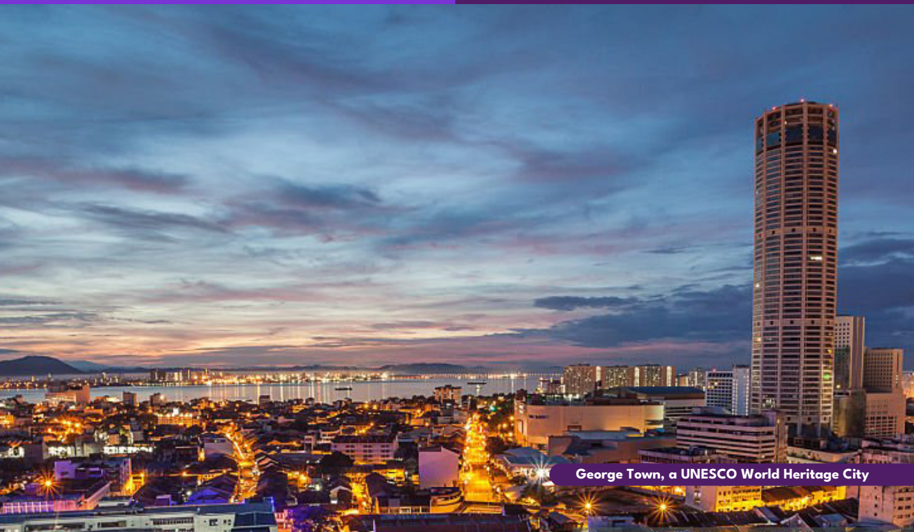
George Town, a UNESCO World Heritage City

“ It (Malaysia) has a mid climate, the people are kind and friendly. The cost of living is low and it is comfortable to live in the country. ”