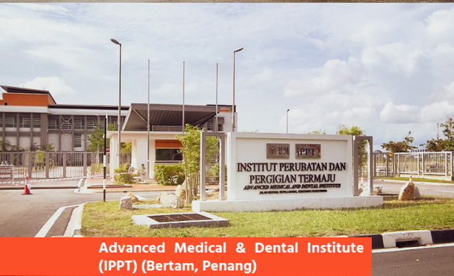
Advanced Medical & Dental Institute (IPPT) (Bertam, Penang)