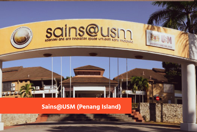
Sains@USM (Penang Island)