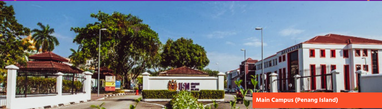
Main Campus (Penang Island)