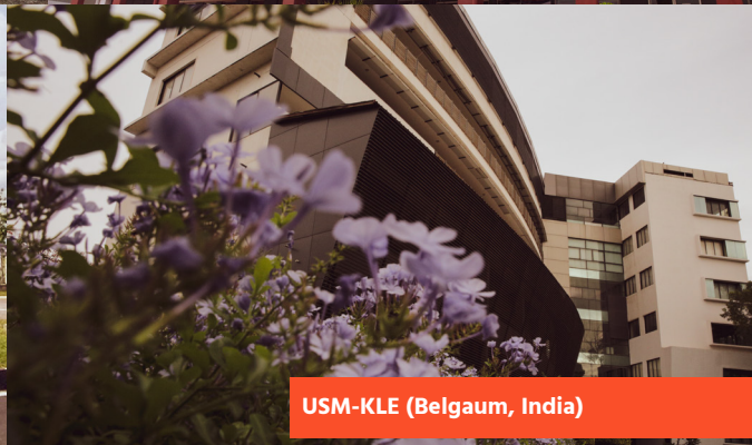
USM-KLE (Belgaum, India)