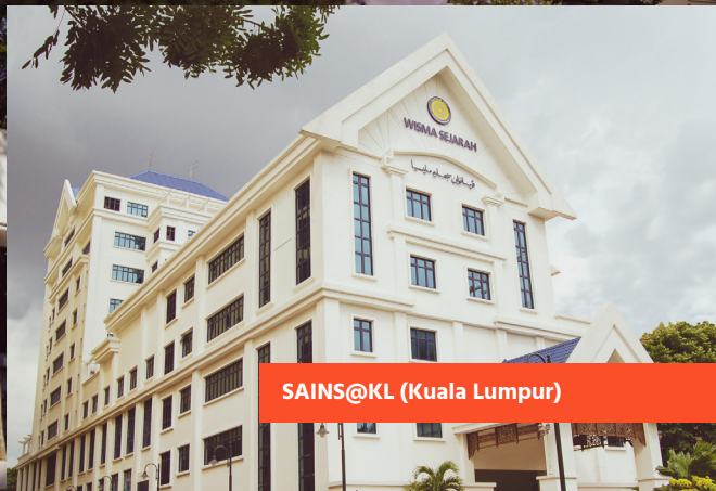
SAINS@KL (Kuala Lumpur)