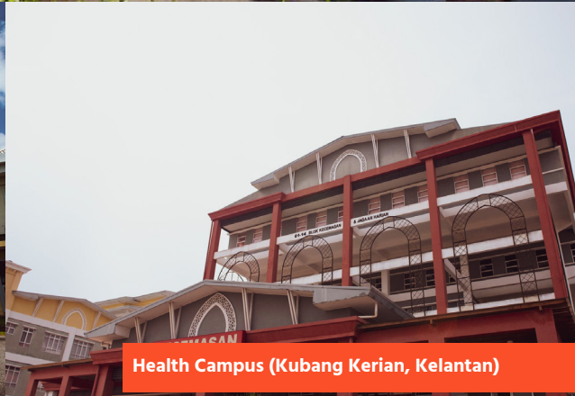
Health Campus (Kubang Kerian, Kelantan)