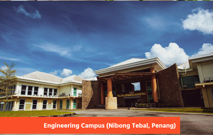
Engineering Campus (Nibong Tebal, Penang)